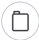
High capacity gel tank