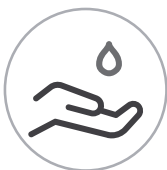
Sanitizing gel dispenser