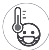
Fever and mask detection